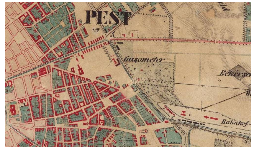
Népszínház street and its surroundings on the 2nd military survey