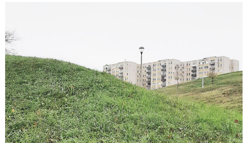
Prefabricated housing blocks facing Darudomb.