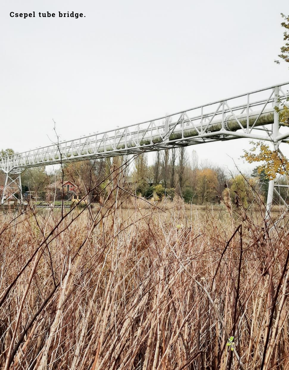
Csepel tube bridge.