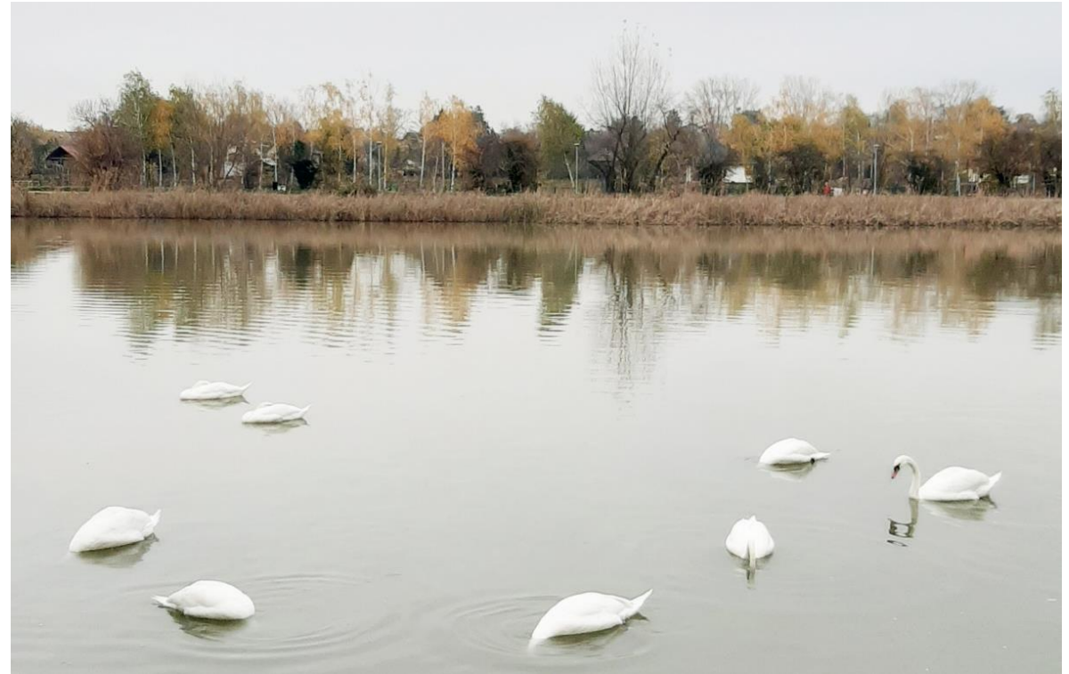
Swans on the Ráckeve branch of the Danube.