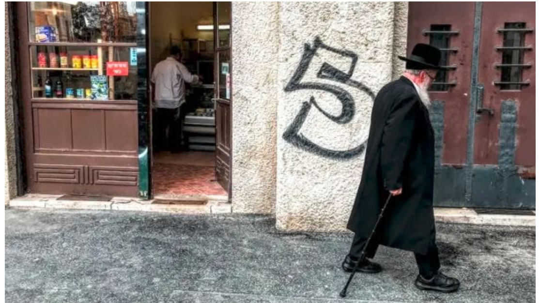
Orthodox Jewish man walking in Inner-Erzsébetváros.

There is a phenomenon however that adversely impacts the potential of residential use in the historic city centre: The presence of mass tourism that contributes to the increased real estate prices, density, and noise pollution. However, the economical benefits of urban tourism are unquestionable since it provides significant income to the city, attracts investments and creates jobs. The present recession in the sector caused by the recent pandemia also provides an opportunity to rethink concerns about urban tourism and propose a more conscious and sustainable policy for its future development.