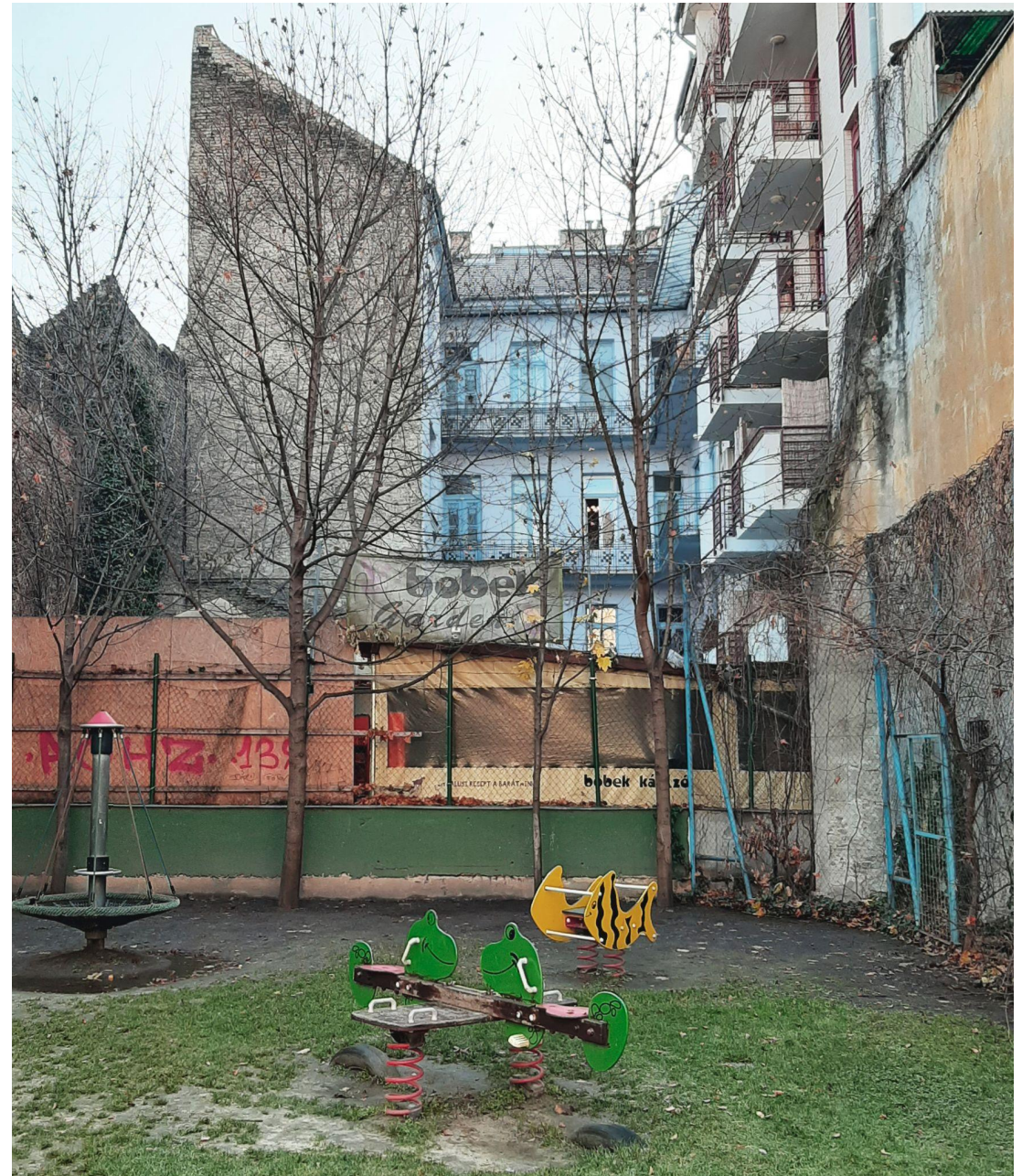
How to live between the dense residential blocks of the XIXth Century and the crowded ruin pubs of the XXIst Century?

During the semester, students create long-term future urban visions for the focus area in teams that have to be presented by texts and visual representations. Based on the urban vision, students have to choose a plot for the individual architectural design of a proposed building . The topic of the individual project has to provide complex answers to the present-day challenges of urban housing, urban tourism and cultural heritage preservation . During the semester there will be one-day-long design exercises when students have to create proposals for pop-up, and other temporary interventions that contribute to the long-term realization of the proposed visions.