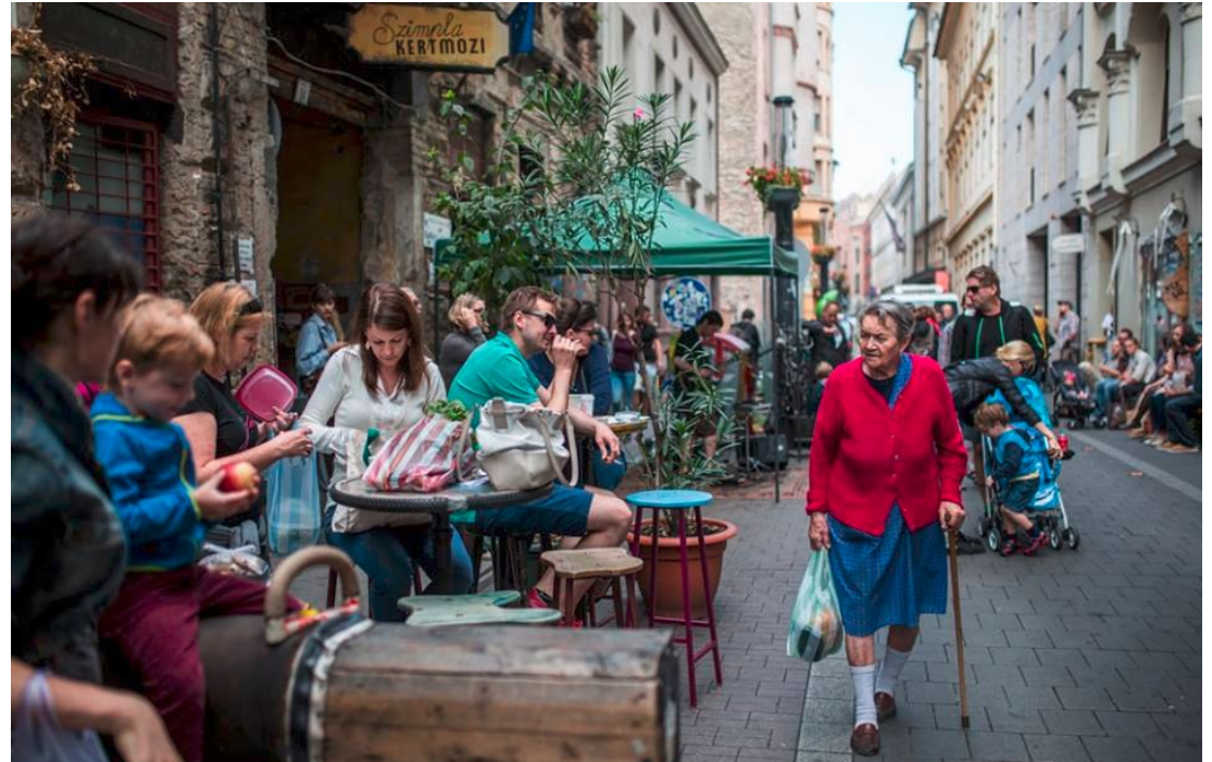
Everyday life in Kazinczy Street nowadays.

Then please send a simple portfolio in a single pdf file to hory.gergely@urb.bme.hu containing only your DD3 project and your favorite project! Deadline for filling the form and sending the portfolio is 7. January 2022. 12:00 noon!