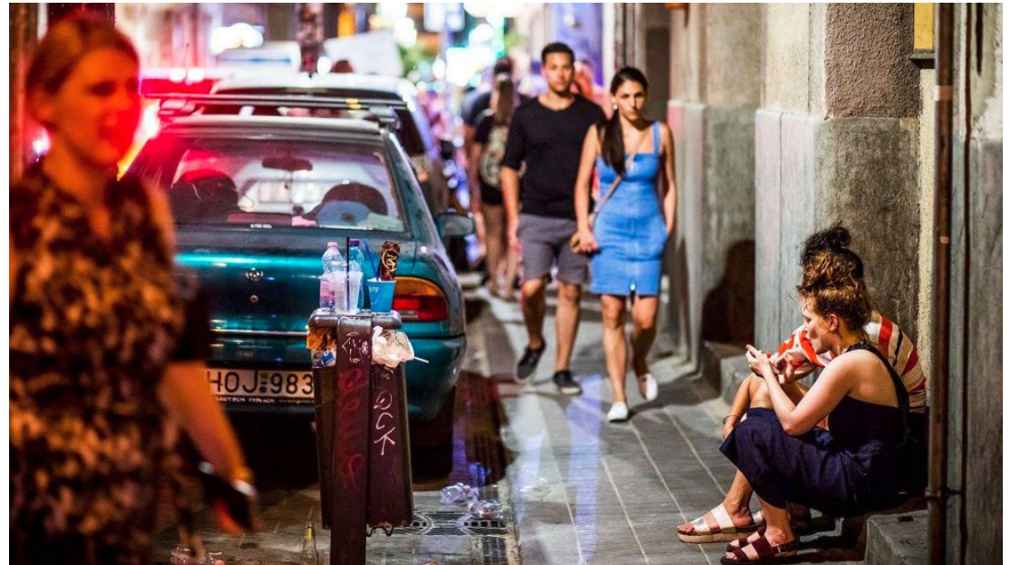
Nightlife in the “Bulinegyed”.