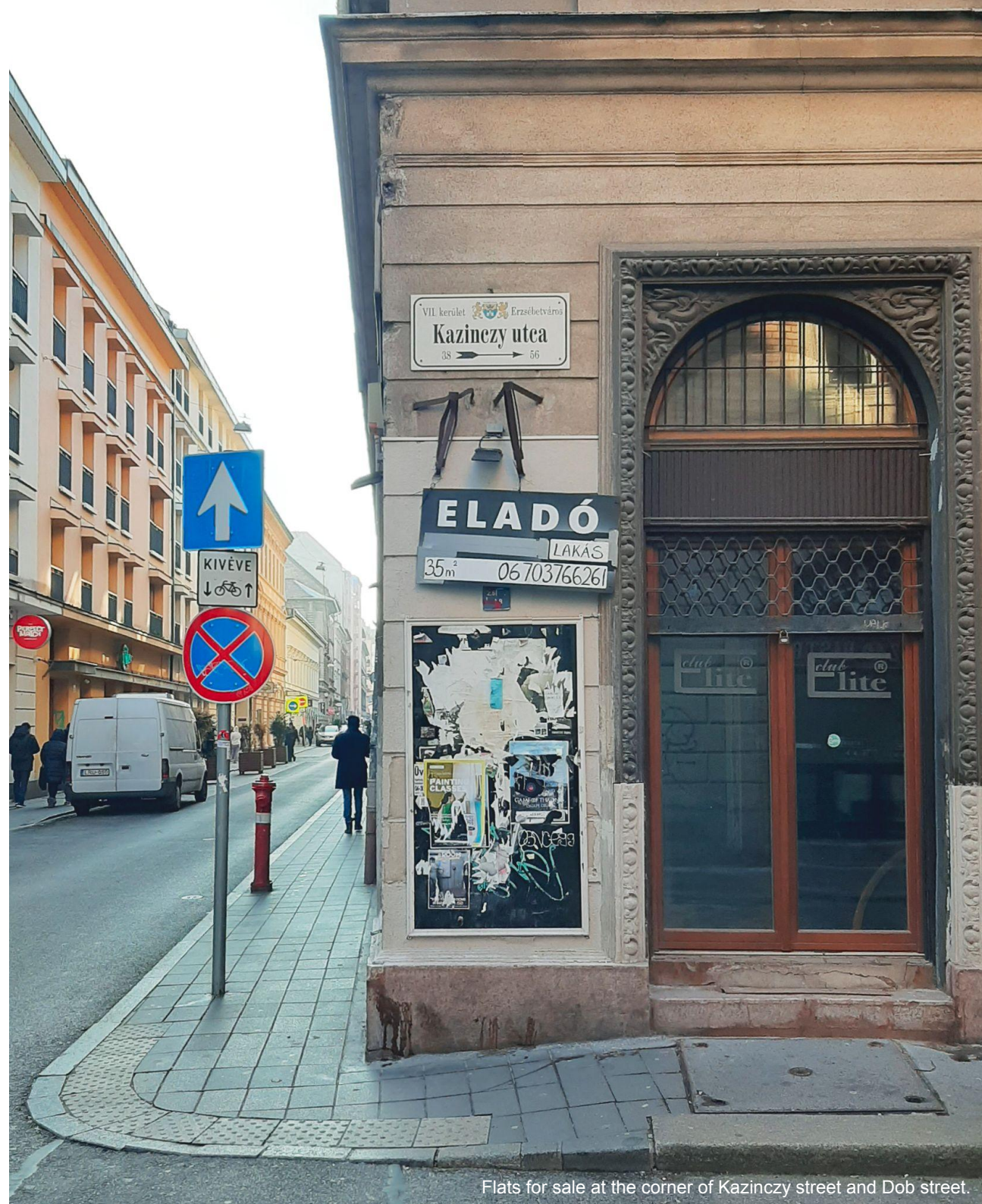
Flats for sale at the corner of Kazinczy street and Dob street.